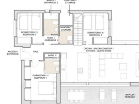
PLANTA BAJA / GROUND FLOOR

Superficie construida / Built area PROPIEDAD / PROPERTY 144.41 m 2 TERRAZAS / TERRACES 13.85 m 2 SOLARIDAD 152.21 m 2 TOTAL CONSTRUIDA / BUILT AREA 216.41 m 2